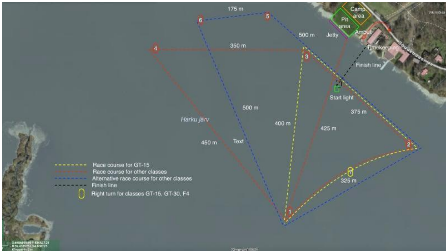
Map of the race course